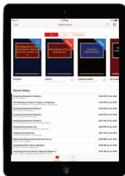
Lexis® Red stand alone

Lexis® Red can be purchased stand alone, with print or as part of a larger package of LexisNexis content