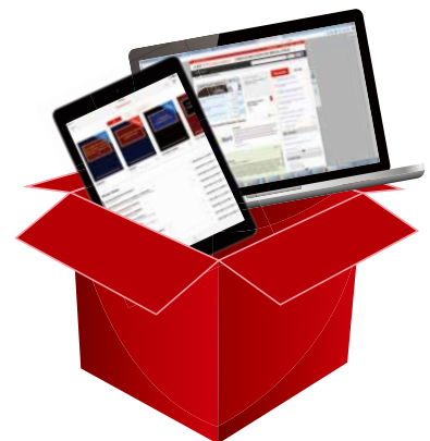
As part of a larger package of LexisNexis content

For more information visit www.lexisnexis.com.hk/lexisred Contact your Account Manager or call Customer Support on +852 2179 7888