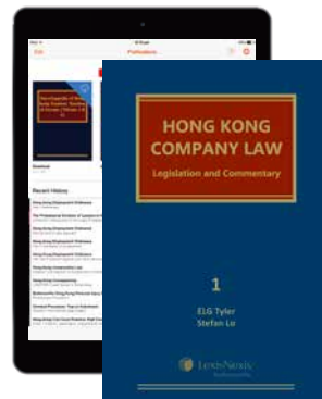
Lexis® Red + print